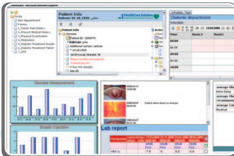
Screen of patient information