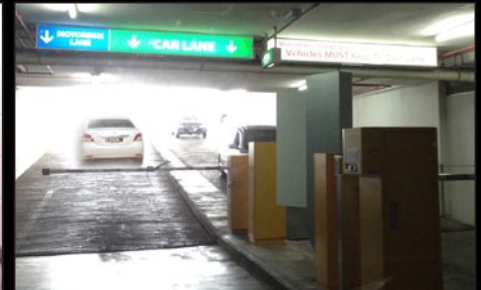
Fast Auto Gate System