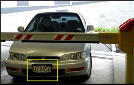
Car Plate Detection